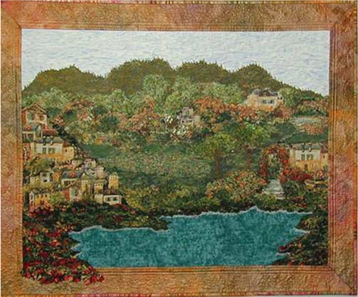
OLD WORLD CHARM